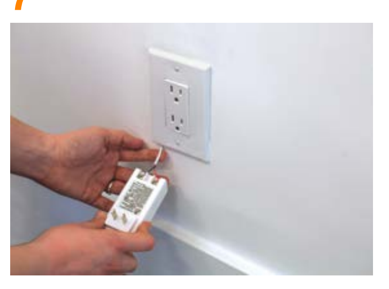
Gently pull the power wire through the wall at the outlet end. You may need to remove your outlet cover to do this.

If your panel has a screw on the top, remove it with a crosshead screwdriver so that you can remove the panel cover. To remove the cover, push the two tabs on top and pull the cover out and down. Don't be alarmed if you hear beeping.