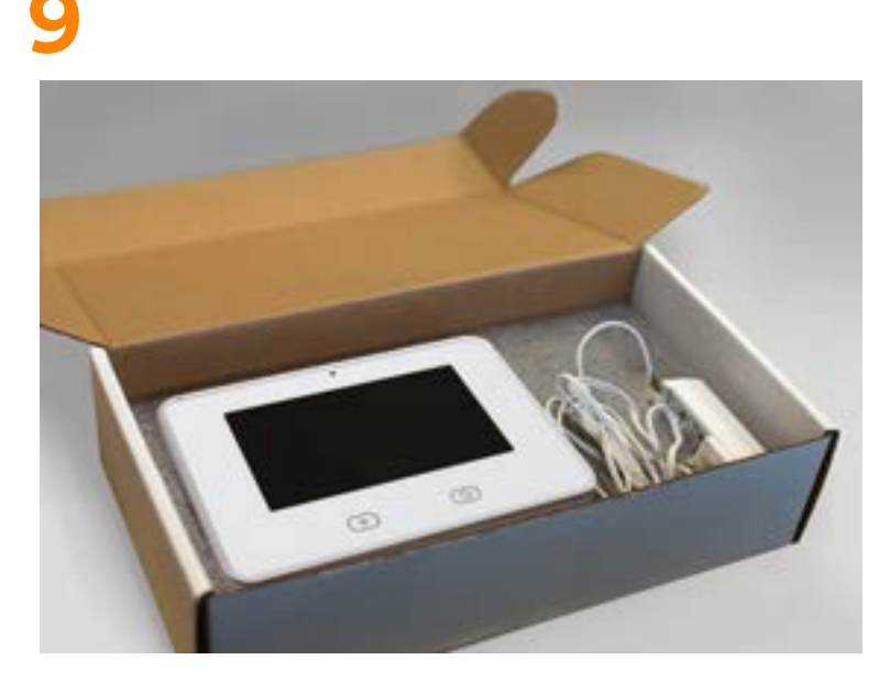
Place your panel, wires, transformer, and any additional screws in a box.