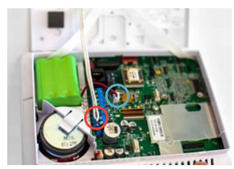
There are two wires you will need to remove: A. The power wire B. The battery wire