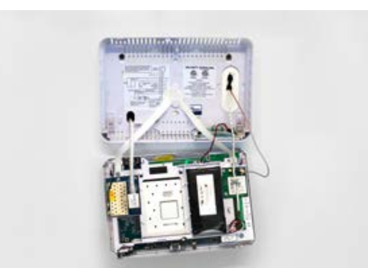
Hang the panel cover on the back plate using the white safety strip.