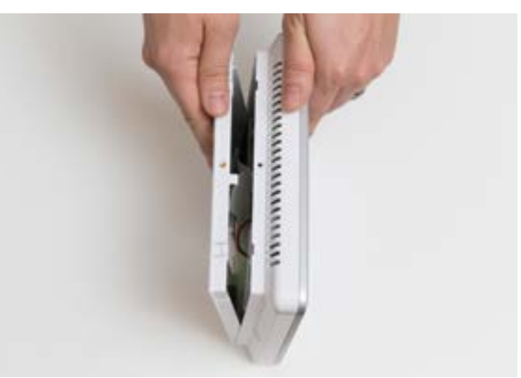
Reassemble your panel by snapping the front cover and backplate together and replacing the top screw.